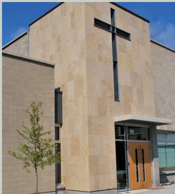
Christ Worship Centre, Surrey, B.C., Canada

JGSW provides one-stop shopping service and offers its customers everything from planning, through fabrication, supply and project installation (Israel only). The company professional staff includes architects, project managers, stone specialists and stone consultants.