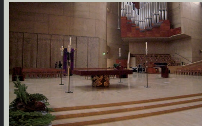
Cathedral of our Lady, Los Angeles, CA