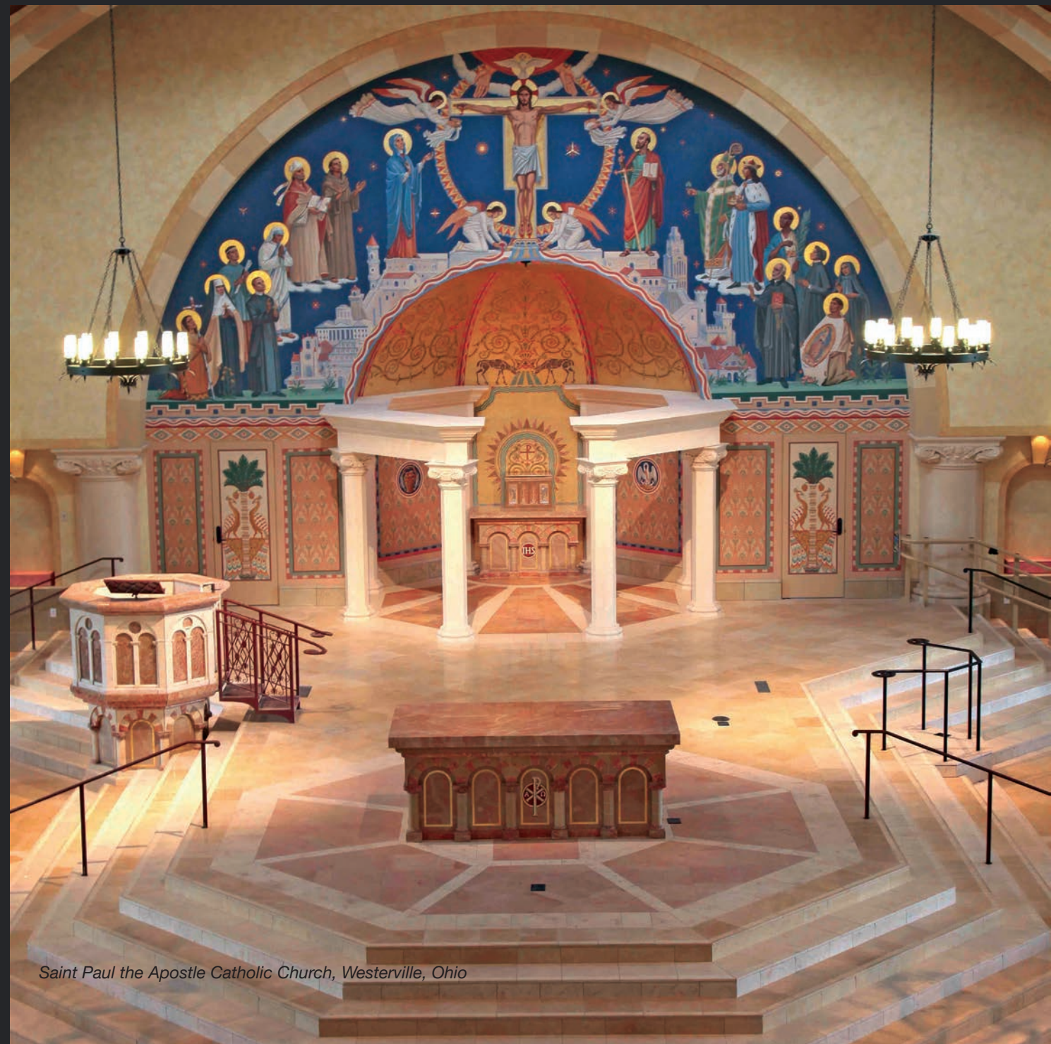
Saint Paul the Apostle Catholic Church, Westerville, Ohio