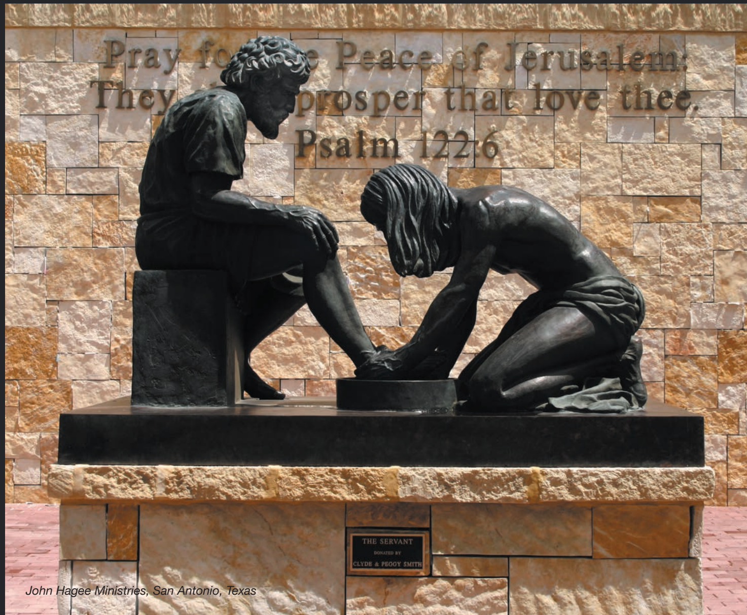
John Hagee Ministries, San Antonio, Texas