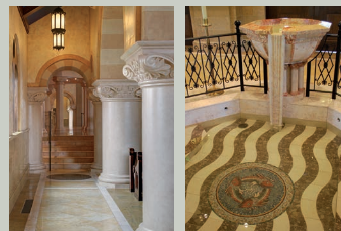
Saint Paul the Apostle Catholic Church, Westerville, OH