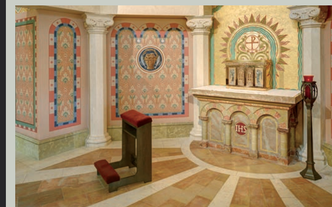
Saint Paul the Apostle Catholic Church, Westerville, OH