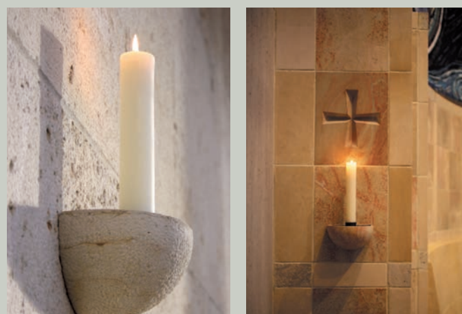
Church of the Transfiguration, Orleans, MA