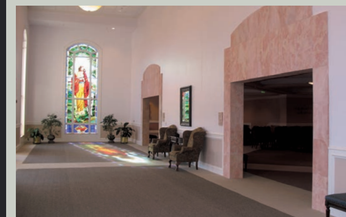
First Baptist Church, Gainesville, GA